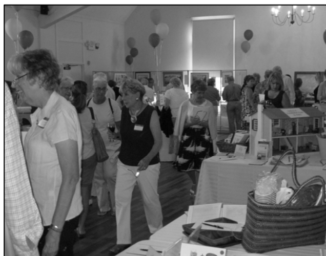
Bidders swarmed through the Parish Hall to see wide range of offerings in the Silent Auction.

delighted by the financial results. Measured financially, this was the second most successful in the auction's seven-year history. Final figures won't be known for a month, but here are tentative results: Net profit to the church, after expenses, was about $33,300. That's up $5,600, or 20 percent, over 2009.